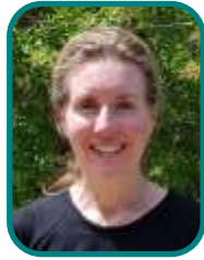
Kirsty Education Support