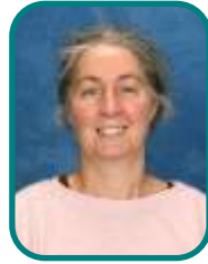
Cassy Education Support